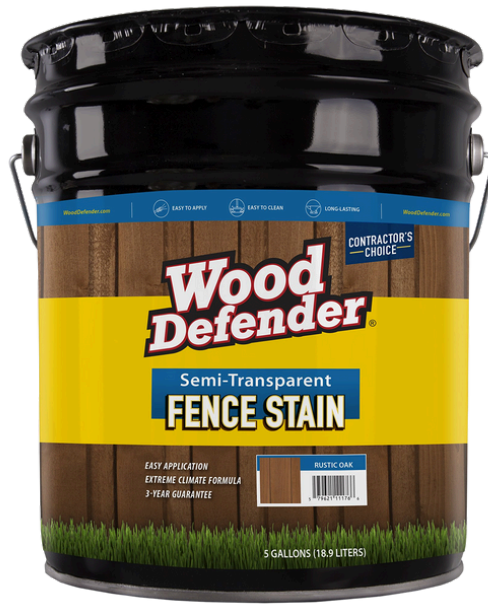
Wood Defender Semi-Transparent