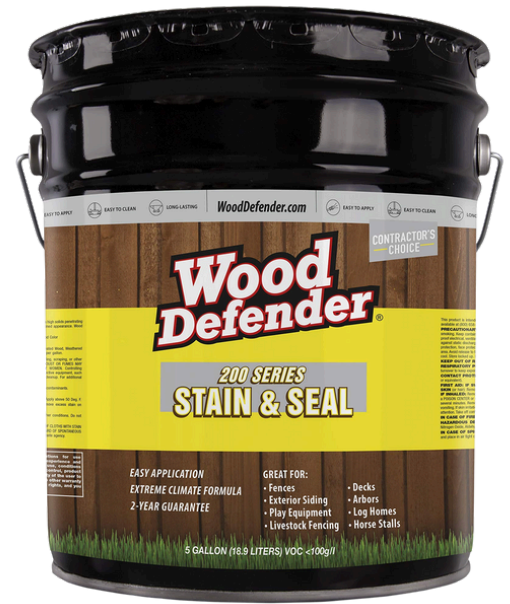
Wood Defender 200-Series