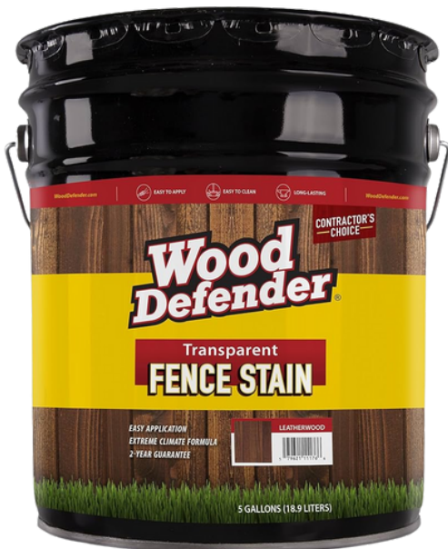
Wood Defender Transparent

At Fencing Unlimited, we provide Transparent, Semi-Transparent, and the 200 Series Wood Defender fence stain options. Choose from our multiple color and finish options to enhance the longevity and curb appeal of your wood fence with ease.